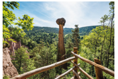
Clockwise from top, Tyrol Castle, Earth Pyramids in Ritten, Castle Trauttmansdorff Gardens and Ritten Railway