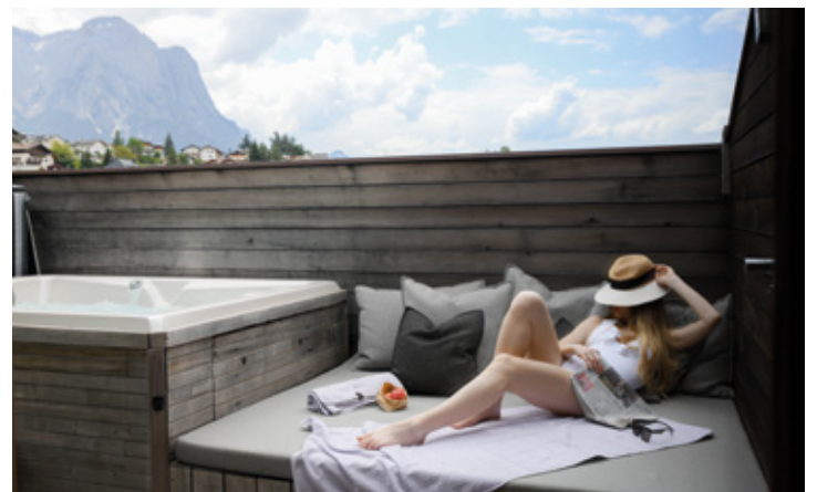
Top, the sauna at Adler Lodge Ritten in Soprabolzano. All other images, Hotel Lamm in Castelrotto