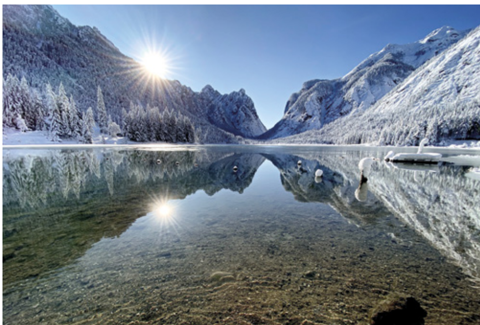
Sleeping under the sky in a chalet with a transparent roof and lake view at Skyview Chalets in Lake Dobbiaco